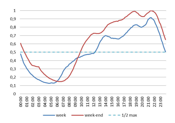
Figure 2 - Daily profile of traffic in the IP core network